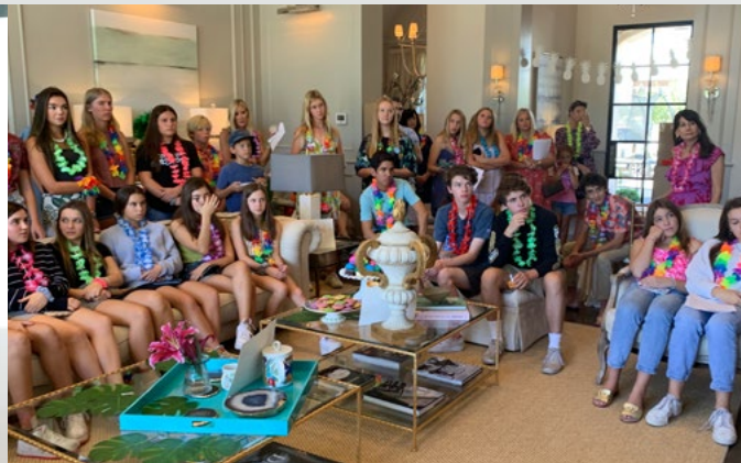
Arizona Wings Chapter