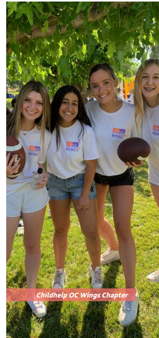
Childhelp OC Wings Chapter

A comprehensive approach to ending child abuse and neglect is only possible with the participation of our community partners, which is why there are a plethora of customized giving opportunities allowing you to direct your generosity to programs and efforts meaningful to you. Childhelp is committed to your success as a community partner and will work with you to match your passion, experience, skills and connections with the needs of our children, ensuring you can have a real and lasting impact in this fight.