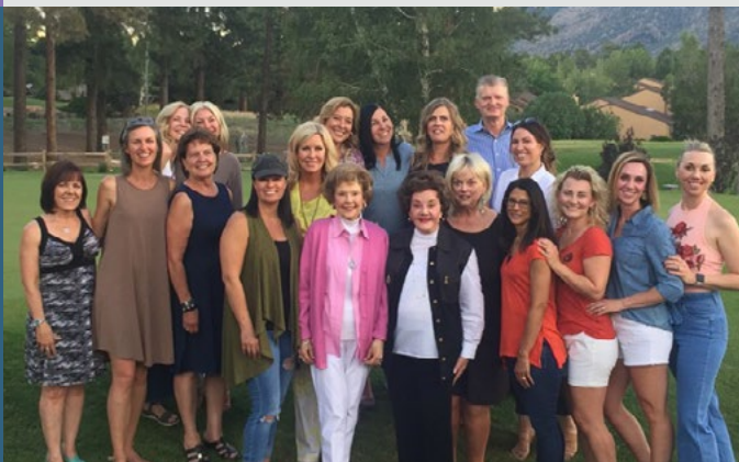
Childhelp Flagstaff Chapter

Greater Washington Area Advisory Board (GWAAB) Washington DC Area Chapter Lake of the Woods Auxiliary Flagstaff Chapter