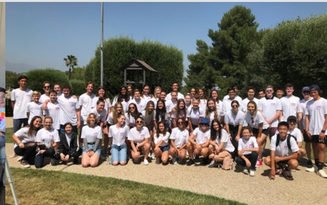
Orange County Wings Chapter