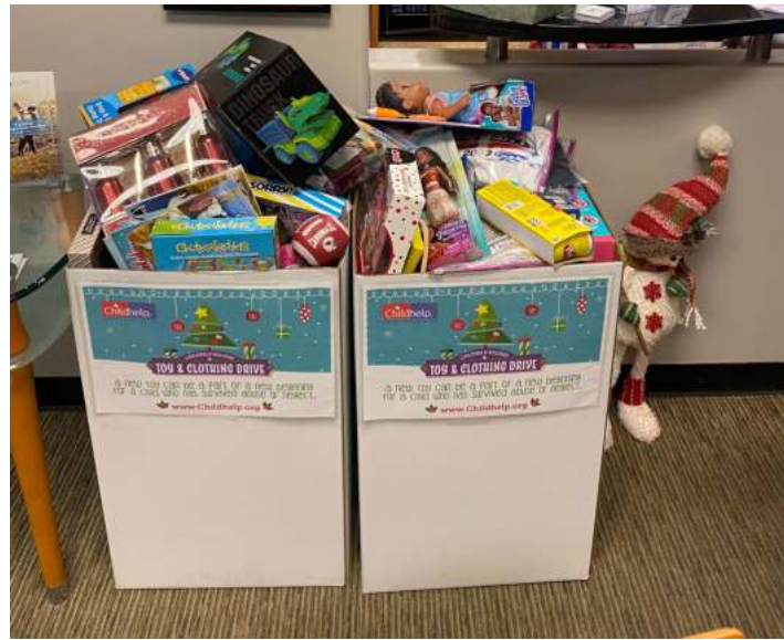
My Chiropractor Health & Wellness